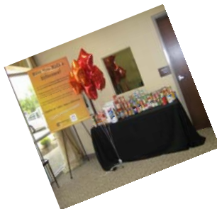
Food donations received during the Health and Wellness Open House.

On July 29, Stautzenberger College, Brecksville joined forces with Clear Channel Communications and KISS FM 96.5, to help feed local families.